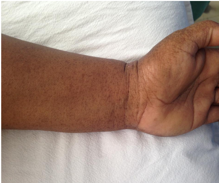
Fig.2 Multiple, slightly atrophic, sharply demarcated, hyperpigmented macules present on forearms