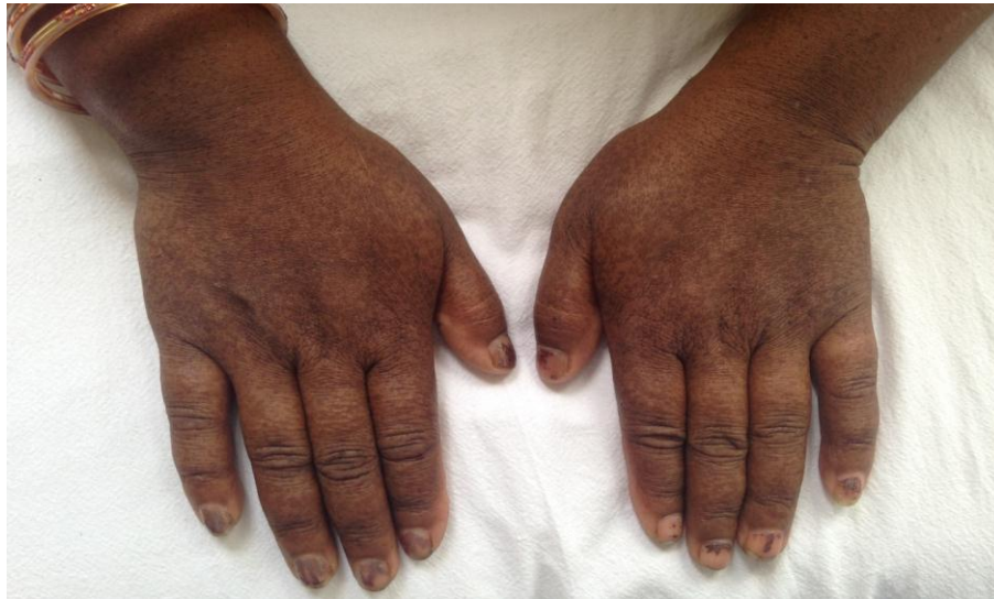
Fig.1 Multiple, slightly atrophic, sharply demarcated, hyperpigmented macules present on bilateral dorsa of hands