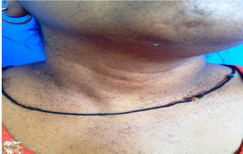
Fig.3 Multiple, slightly atrophic, sharply demarcated, hyper pigmented macules present on all sides of neck and upper chest region