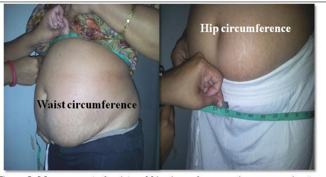
Figure 5: Measurement of waist and hip circumference using a measuring tape