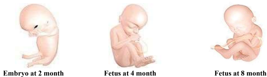
Fig:3 Foetal development during pregnancy

During the early stages of pregnancy, since the placenta is not yet formed, there is no mechanism to protect the embryo from the deficiencies which may be inherent in the mother's circulation. Thus, it is critical that an adequate amount of nutrients and energy is consumed. Additionally, the frequent consumption of nutritious foods helps to prevent nausea, vomiting, and cramps. [7] Supplementing one's diet with foods rich in folic acid, such as oranges and dark green leafy vegetables, helps to prevent neural tube birth defects in the baby. Consuming foods rich in iron, such as lean red meat and beans help to prevent anemia and ensure adequate oxygen for the baby. [8] A necessary step for proper diet is to take a daily prenatal vitamins, that ensure their body gets the vitamins and minerals it needs to create a healthy baby. These vitamins contain folic acid, iodine, iron, vitamin A, vitamin D, zinc and calcium. [9]