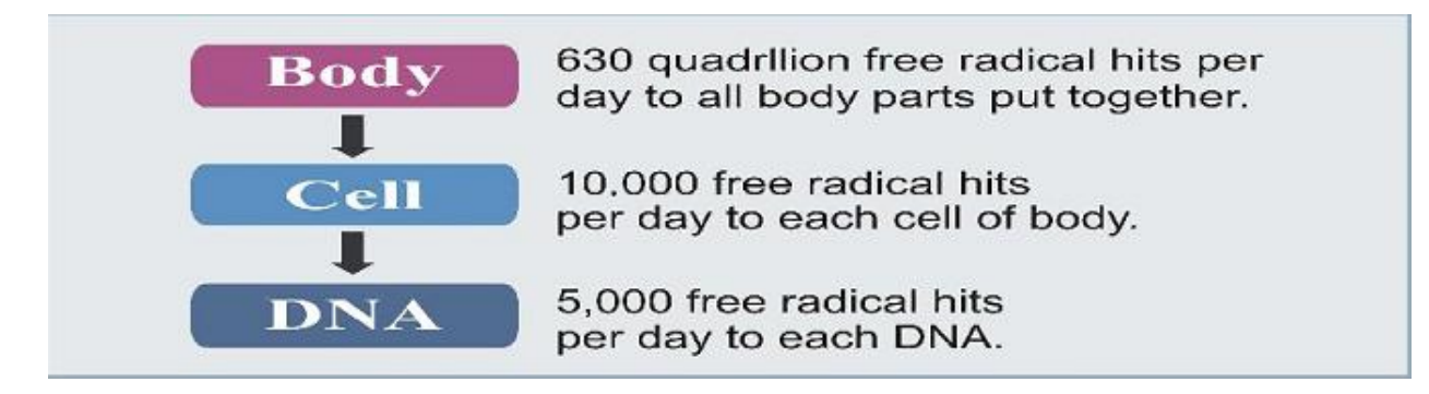
FIG.1: Oxidative stress to body, Cell & DNA

Protection against all of these processes is dependent upon the adequacy of various antioxidant substances that are derived either directly or indirectly from the diet. Consequently, an inadequate intake of antioxidant nutrients may compromise antioxidant potential, thus compounding overall oxidative stress.