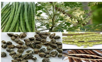
Fig:1 Moringa Oleifera

This way of doing things is seen as better for the environment compared to using chemicals, which can be pricey, harmful, and create waste. It's good at clearing up cloudy water, getting rid of solids and other unwanted stuff, and killing germs. The seeds of M. oleifera are thought to be the best natural option. They're full of things that help clump stuff together, which cleans the water. The active stuff in Moringa, like cationic polymers, and what you get when you soak the seeds in water, hold proteins that make it a good water cleaner (12) .