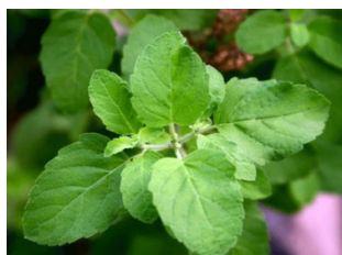
Fig:2 Holy Basil

The remedy is also utilized to treat ailments like fever, bronchitis, arthritis, and convulsions. Ocimum sanctum or holy basil, which is synonymous with Tulsi, has a special place in the Hindu community due to its unique meaning. The word TULSI literally means "one without more." Tulsi, a natural remedy and herbal medicine, is revered in Ayurveda as an essential oil that has antibacterial, viral, antifungal, probiotic, antibiotic, mosquito repellent (anti-emesis), oral, throat, digestive, and sexual properties. It also holds spiritual and medicinal benefits (13,14) .