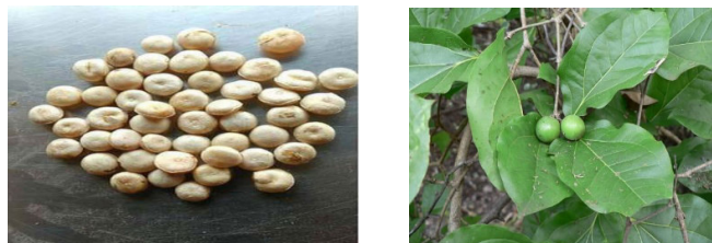
Fig:3 Strychnos potatorum

In some places, Strychnos potatorum 's ripe fruit pulp is used to make soap and laundry detergent (17) .