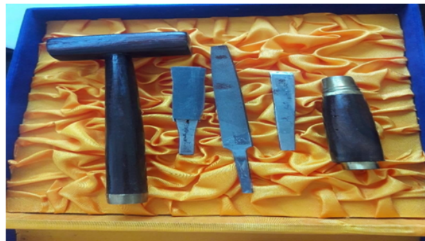
Fig 1: Tools for Teeth Cutting.

There are four tools that come into direct contact with people who have their teeth cut. consists of: