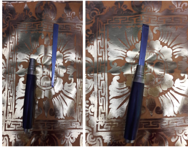
Fig 5: Chisel

3. Miser: this file cannot be purchased in the form of a manufacturer's item, it's just that it is long so that when used it can hit the lips or gums. This file also has a section that can be inserted into the handle as a tool holder.