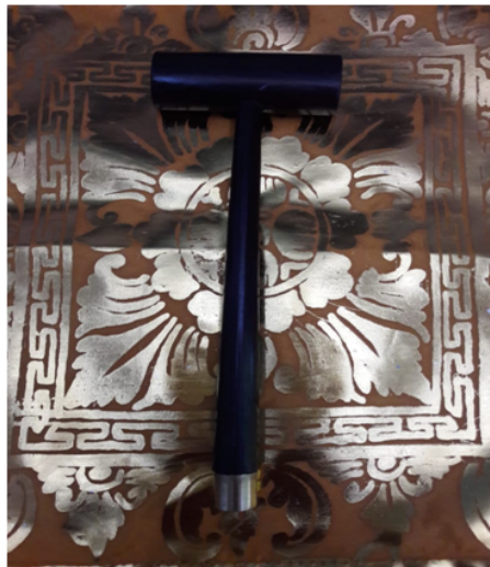
Fig 4: Hammer