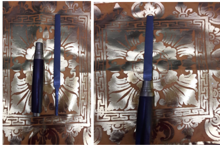
Fig 6: Miser

3. Miser: this file cannot be purchased in the form of a manufacturer's item, it's just that it is long so that when used it can hit the lips or gums. This file also has a section that can be inserted into the handle as a tool holder.