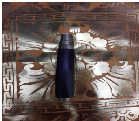
Fig 2: Handle

1. Handle / holder, The holder is a tool that does not enter the mouth, only as a tip holder