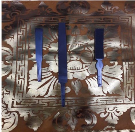
Fig 3: Chisel, File, Sharpener

Is a tool that goes into the mouth for the act of cutting teeth (chisel, file and sharpener). Like the picture below: