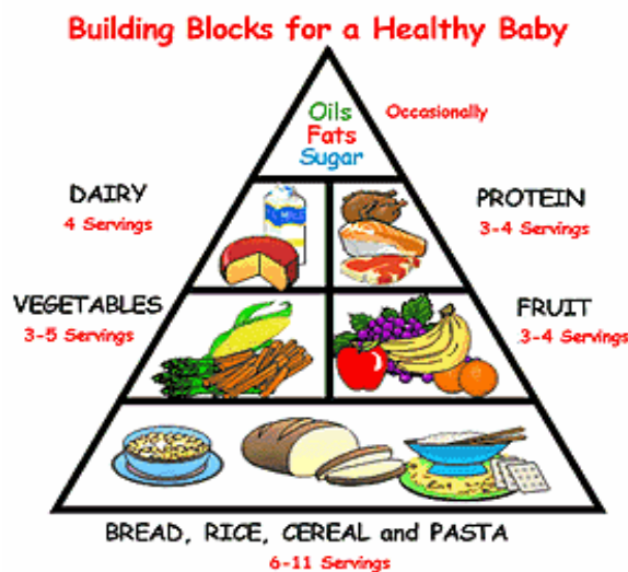
Fig: 1 Building blocks for a Healthy Baby

mothers follow instructions listed on particular vitamin packaging as to the correct or recommended daily allowance (RDA).