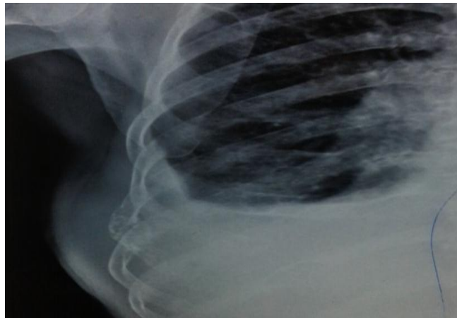
Fig. 2 - Chest X ray PA view showing right sided pleural effusion and large extra pulmonary opacity with well defined margin and lytic lesion in the mid-part of 8 th rib.

normal limits. Serum calcium was normal. Chest x ray was done which showed right sided massive pleural effusion and lytic bone lesion in 8 th rib (fig.2).