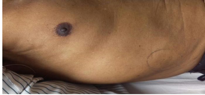
Fig. 1 Clinical photograph showing diffuse swelling on lateral aspect of right side of chest wall.

Clinical diagnosis of soft tissue sarcoma was offered. Routine haemogram showed hemoglobin 9 gm/dl and total and differential leucocyte counts were within